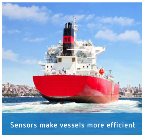
Sensors make vessels more efficient