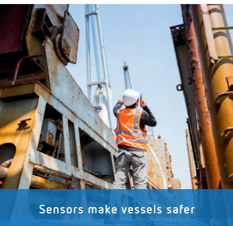
Sensors make vessels safer

Althen Sensors & Controls offers a broad range of high-quality solutions from specialized manufacturers for various maritime applications, such as joysticks, pressure sensors, load cells, position sensors and inclinometers. These industrial products are superior in terms of robustness, reliability and accuracy to perform in even the harshest environments. With over 40 years of experience in sensor technology and in-house engineering capabilities, Althen has the flexibility to offer customized solutions and co-create with its customers.