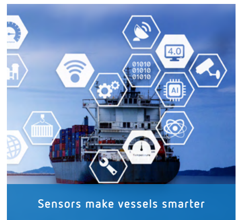
Sensors make vessels smarter

We provide confidence for visionary engineers.