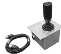
Marine (DP) Joysticks

Specially designed for dynamic positioning.