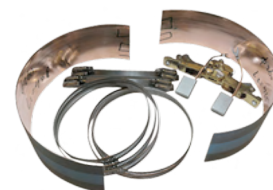
Propeller Shaft Earthing Systems